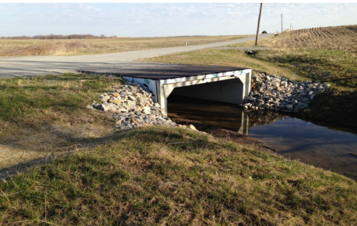
Prospect Rd., Pleasant Rd., and Main Rd. Intersection.